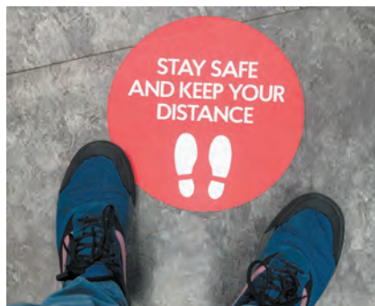
Decals & Stickers